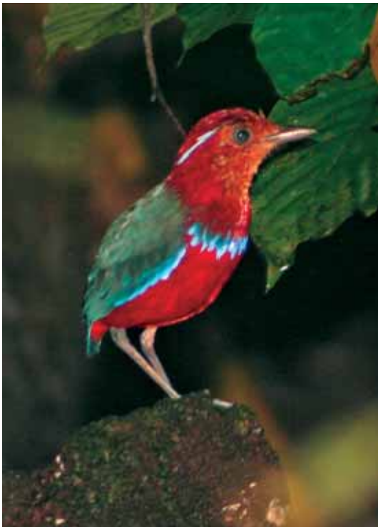
Plate 6. Blue-banded Pitta Pitta arquata , Danum Valley, Sabah, October 2008.