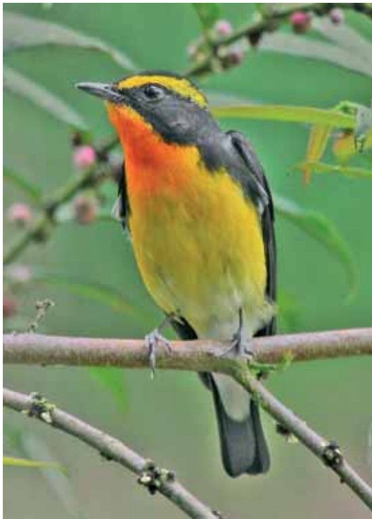
Plate 14. Narcissus Flycatcher Ficedula narcissina , Borneo Highlands Resort, Sarawak, March 2009.