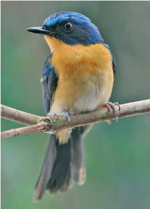
Plate 9. Bornean Blue Flycatcher Cyornis superbus , Bintulu, Sarawak, January 2007.

This ‘very uncommon lowland and submontane resident’ (Mann 2008), was recorded by JE at Long Lellang in 2010 when several individuals were seen. It has also been recorded by B. King near Bario. Sreedharan (2006) caught two breeding birds at Camp 5 in Pulong Tau NP in 1996. The species