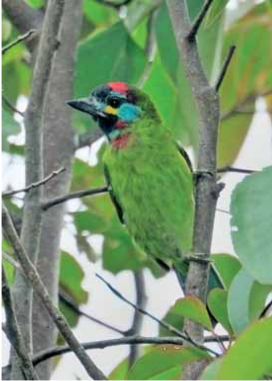
WONG TSU SHI