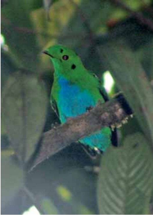
Plate 4. Hose's Broadbill Calyptomena hosii , Poring Hot Springs, Sabah, October 2008.