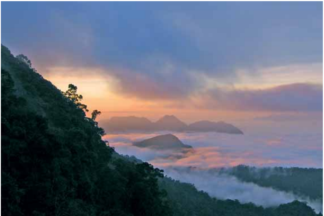
Plate 1. Dawn over Kalimantan from look-out point at Gn Penrissen, Sarawak, March 2009.

That Sarawak is neglected is clear from an examination of the itineraries offered by major bird tour companies. Most confine themselves to Sabah, visiting the well-known sites of Mt Kinabalu, Crocker Range, Danum Valley, Kinabatangan River and Sepilok, often coupled