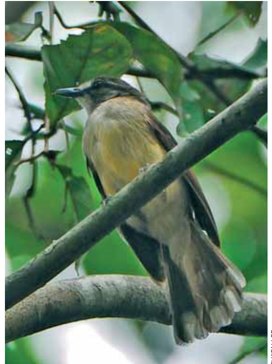
Plate 10. Hook-billed Bulbul Setornis criniger , Sungai Binyo, Bintulu, Sarawak, August 2006.

This globally Vulnerable species, otherwise found only on Sumatra, is one of the least known bulbul species on Borneo and seldom recorded by birdwatchers on the usual birdwatching circuits owing to the lack of its preferred habitat. It is a specialist of stunted forest types—peatswamp and heath forest up to 1,000 m—both of which have been severely reduced by deforestation and fires. Although it is probably most easily seen in parts of