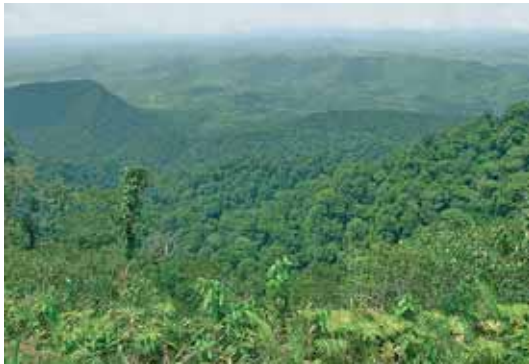
Plate 13. View over Kalimantan from look-out point at Gn Penrissen, Sarawak, March 2009.

Borneo Highlands Resort Borneo Highlands provides easy access to mid-mountain forest from 850 m at the plateau area, where the main facilities and the golf course are located, to about 1,300 m at