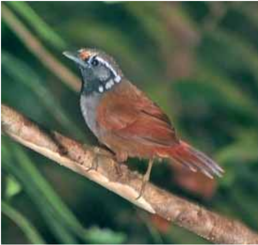
Plate 8. White-necked Babbler Stachyris leucotis , Poring Hot Springs, Sabah, October 2008.