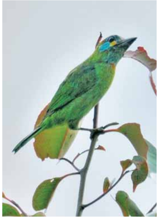
WONG TSU SHI

By no means all Borneo's endemic birds can be said to be readily found in Sabah. Sarawak offers an opportunity to see and, in some cases, to help locate/rediscover a number of species few have encountered. One of the islands most interesting endemics, the aptly named Pygmy White-eye Oculocincta squamifrons , is surely easier to see in the mountains of Sarawak, at sites such as Ba' Kelalan and Borneo Highlands Resort, than at any other site in Malaysian Borneo. The following list gives details of a number of birds that visitors to Sarawak should look for, including species more likely to be found in Sarawak than in Sabah, even if finding some of them may require a bit of an expedition!