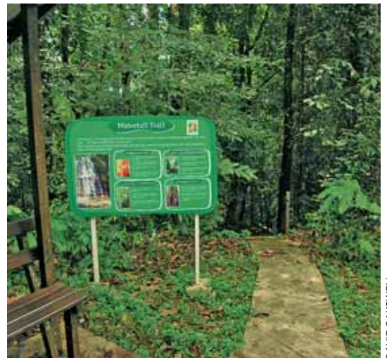
Plate 5. Waterfall Trail, Kubah NP, Sarawak, March 2009.

This extremely attractive endemic species is probably easier to see in the Kelabit Highlands than in its known localities in Sabah. Ben King found it