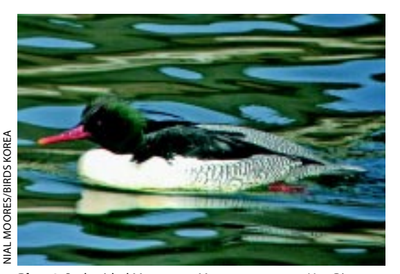
Plate 2. Scaly-sided Merganser Mergus squamatus, Han River, January 2005.

have estuarine barrages. The Nakdong (506 km) is the longest and has the most dams (308) within its catchment, while the Han River is the largest in terms of drainage area and annual runoff volume, accounting in both cases for approximately a quarter of the national total (KOWACO 2004).