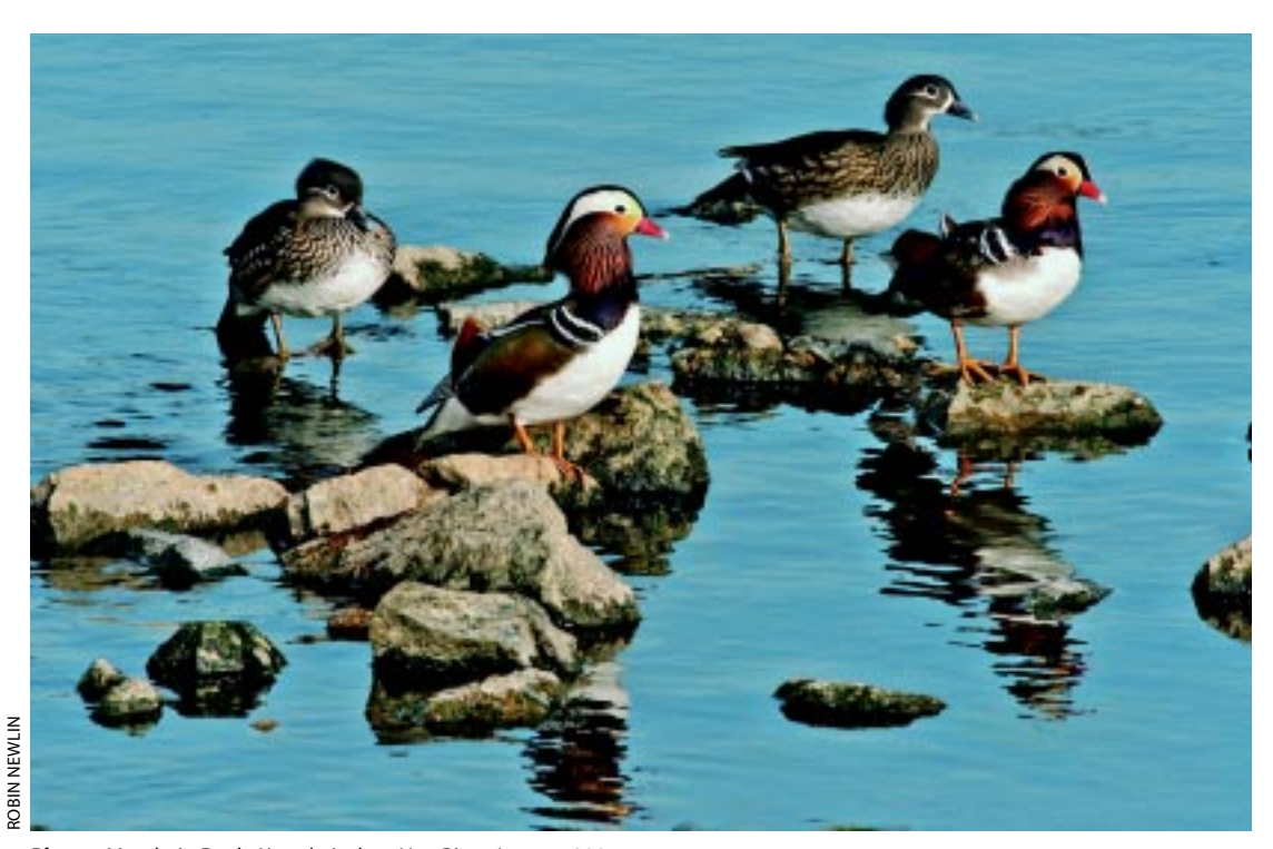
Plate 5. Mandarin Duck Aix galericulata, Han River, January 2007.

Korea, thanks to an international email campaign in March 2008, letters of concern sent by conservation organisations including the International Crane Foundation, Australasian Wader Studies Group and BirdLife International, and to the efforts of Korean NGOs who visited Europe in summer 2008 and held meetings with the Ramsar Secretariat in Switzerland, the RSPB and BirdLife International in the UK, and with Wetlands International in the Netherlands.