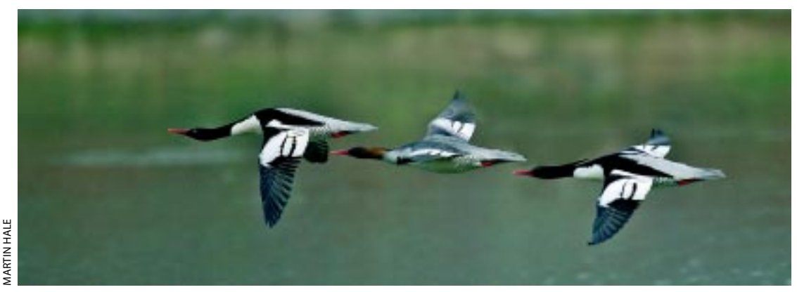
Plate 6. Scaly-sided Merganser Mergus squamatus, Jiangxi Province, China, November 2007.