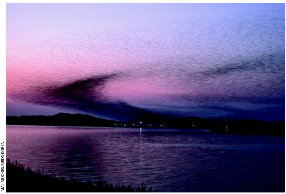
Plate 4. Baikal Teal Anas formosa by night, Geum River, December 2006.

would be environmentally friendly, as it would reduce movement of freight by road and rail; while the construction of inland ports would boost local economies.