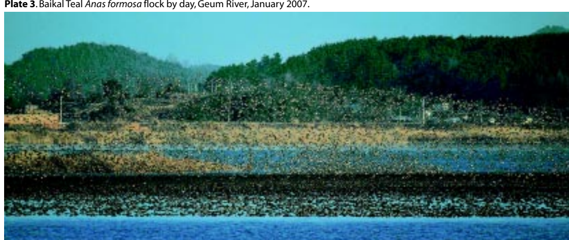
Plate 3. Baikal Teal Anas formosa flock by day, Geum River, January 2007.

Perhaps due to its grand vision, the Korean Grand Canal Project was initially a popular component of the national election campaign in 2007. Proponents argued, and continue to argue, that the passage of 5,000 tonne ships "from sea to mountain to sea again" through the canal system