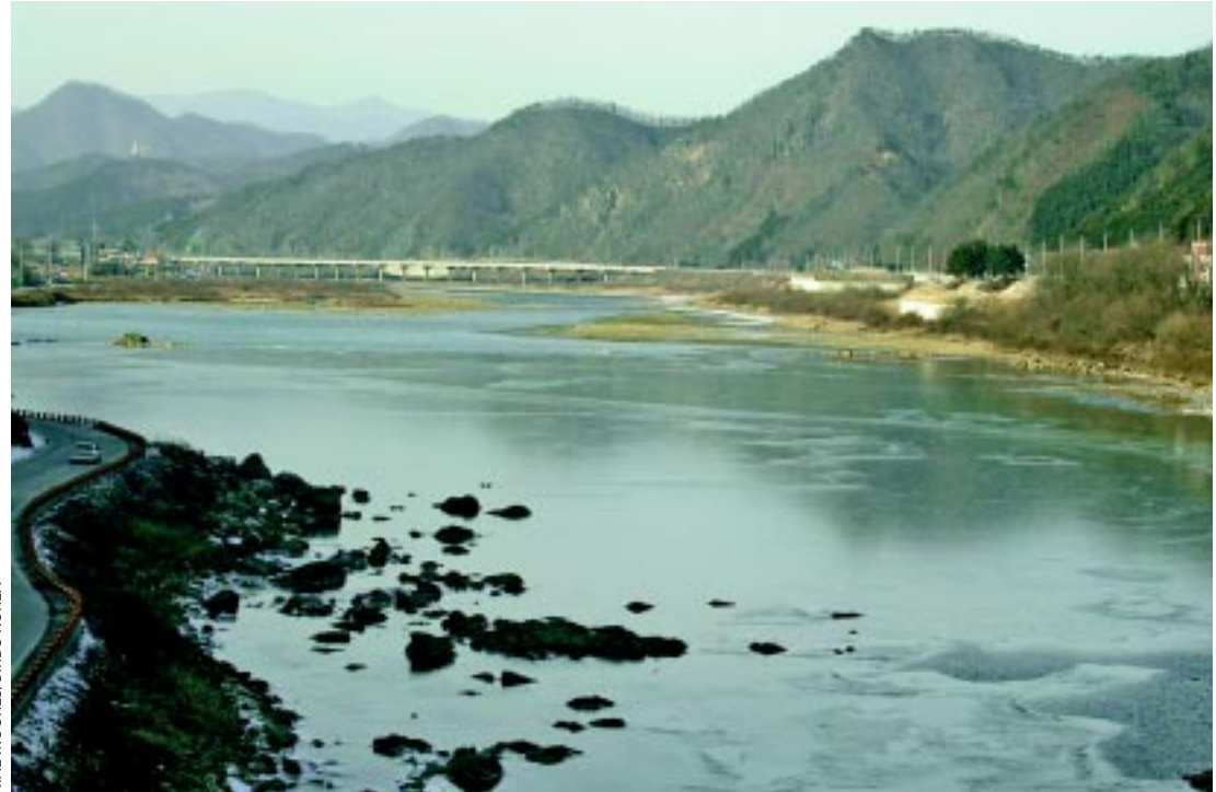
Plate 1. Stretch of Han River used by Scaly-sided Mergansers Mergus squamatus, January 2005.

South Korea is a highly developed, densely populated, rather mountainous peninsula, a little under 100,000 km² in area, lying between 38°N–34°N and 126°E–130°E. Mean temperatures range from -6° to +7°C in January and +23° to +27°C