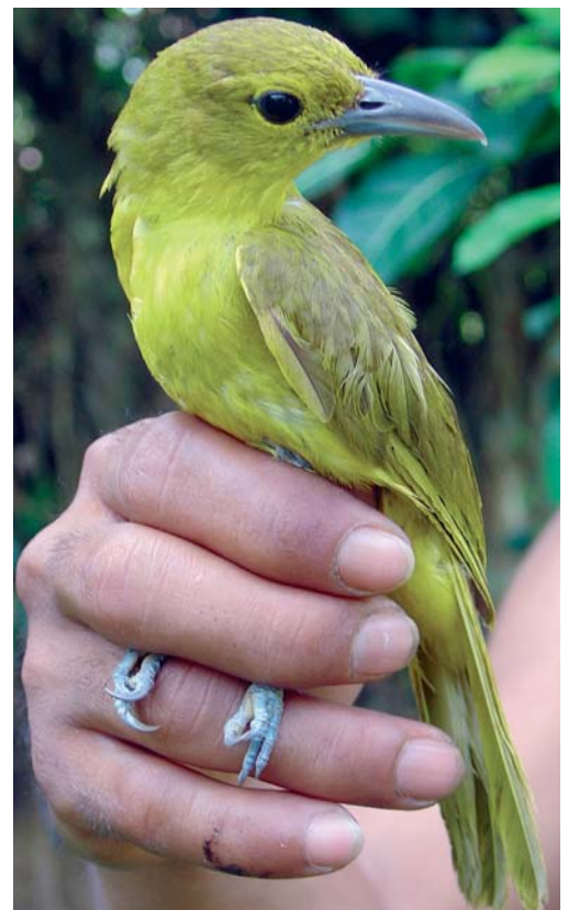
Plates 1–3. Isabela Oriole Oriolus isabellae , April 2004, Ambabok, San Mariano, Isabela, Luzon, Philippines.