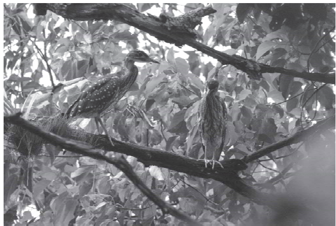
Plate 2. Two immature White-eared Night Herons in Ba Be National Park, April 2009. (Jonathan C. Eames)

immature birds (Plate 2). Two adults and two immatures were later seen by Sarah Brook, Stephan Lauper, Simon Mahood, Jill Rischbieth and Nicolas Wilkinson leaving the roost area on 3 May 2009. The following day, an inspection of the nest site revealed that all birds had left the nest, although an immature was found roosting nearby.