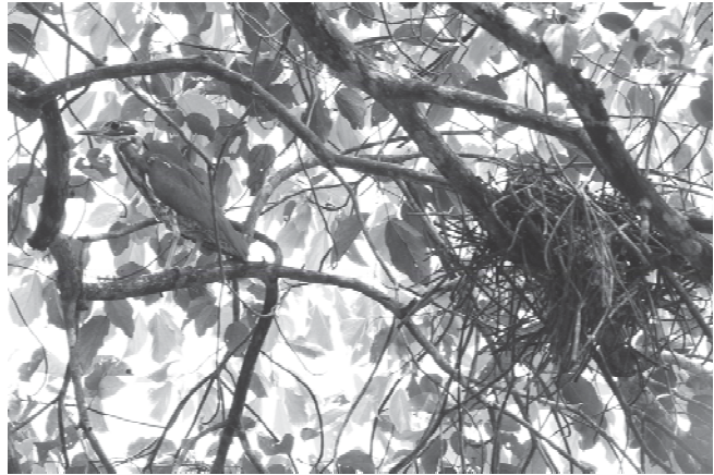
Plate 1. Adult White-eared Night Heron at the nest in Ba Be National Park, April 2009.