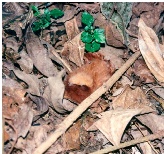
Plate 1. Great Eared Nightjar Eurostopodus macrotis chick, Masipi-East, Isabela province, Luzon, Philippines, April 2002.

On a separate note, the species is commonly reported to be crepuscular i.e active at dusk and dawn. It is indeed active at twilight, but it is also active during the night. Its characteristic call (a sharp 'tsiik', followed after a short pause by a two-syllable 'ba-haaaww') was heard every evening and night.