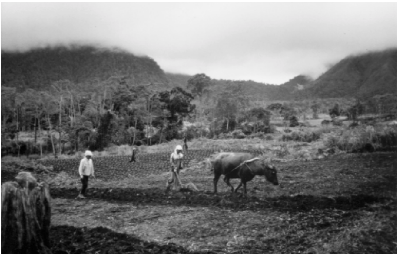
Figure 3. The type locality of Scolopax bukidnonensis on Mt. Kitanglad on 22 January 1995, the day the holotype was captured.