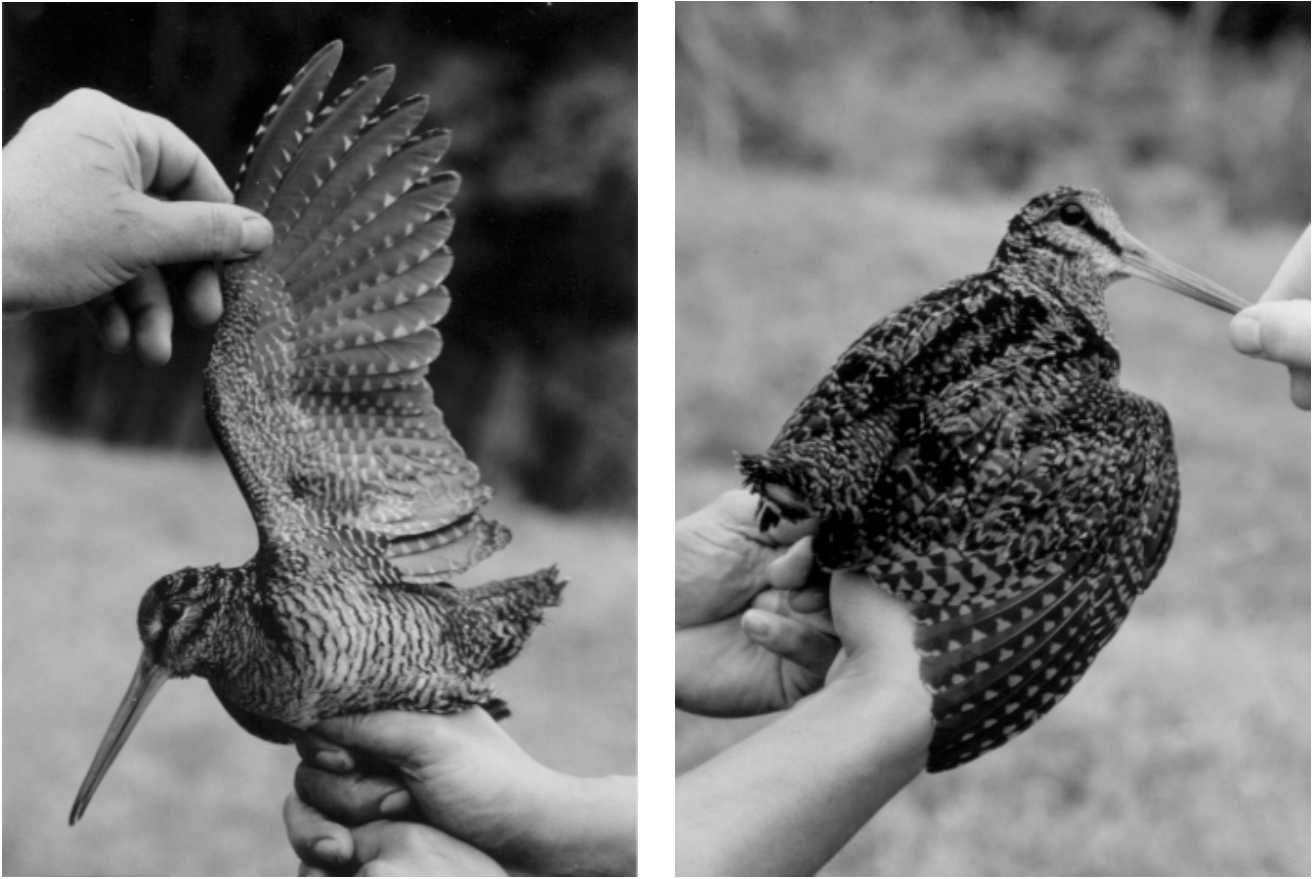
Figure 2. The holotype of Scolopax bukidnonensis shortly after it was captured on Mt. Kitanglad.