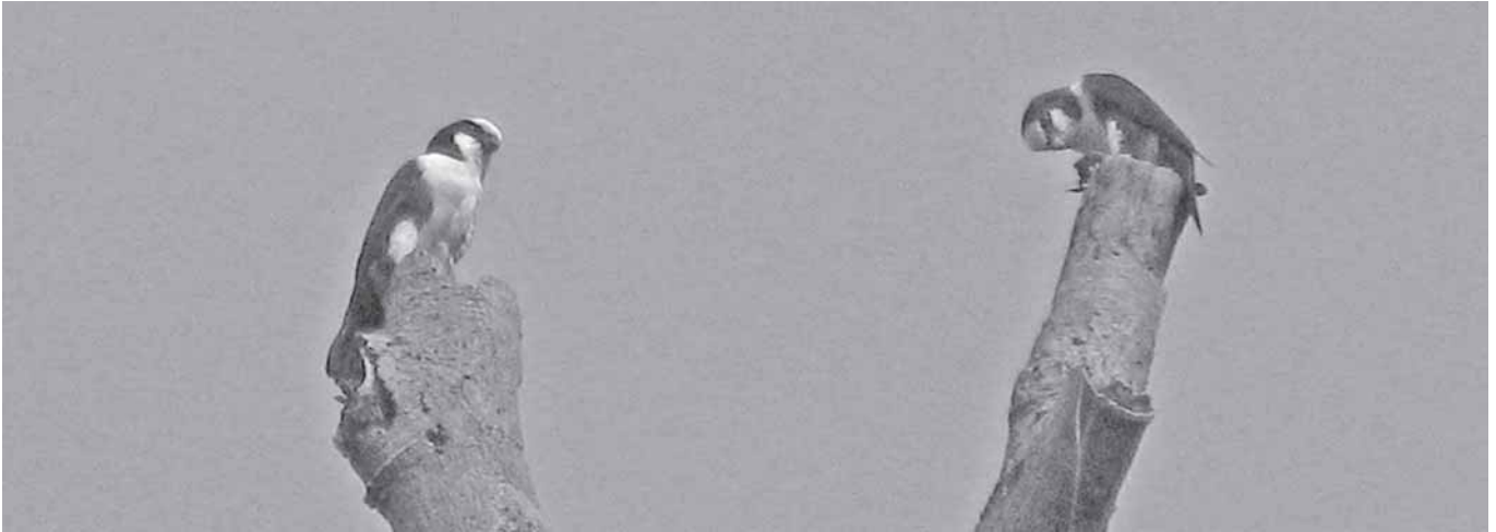
Plate 1. Two male White-fronted Falconets Microhierax latifrons , 1 June 2011, Nunukan, East Kalimantan (M. Irham).

1). Several hunting manoeuvres were observed in which insects were caught in the air with a loop flight and consumed in c.2 minutes after returning to the initial posts.