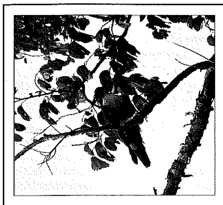
Plate 1. Adult Rufous-bellied Eagle Hieraetus kienerii.